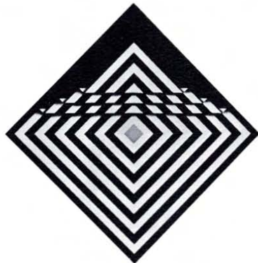
Choachi , 1970, by Omar Rayo.