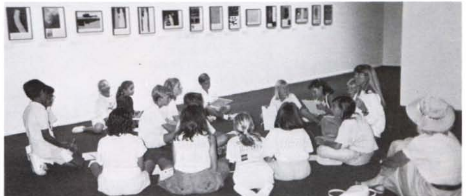
Upper elementary-school students learned to understand and appreciate contemporary art at a recent program held at the Museum in conjunction with the 'Featuring Florida 2: Three from Tallahassee' exhibition in the New Wing.